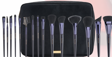
8-Piece Deluxe Brush Set | 46MBR or 15-Piece Pro Brush Set | 49MBR