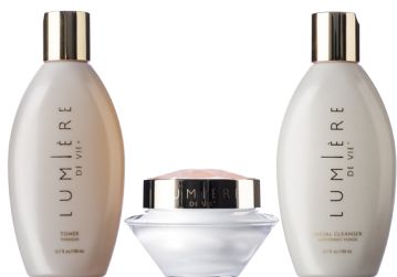
Lumière de Vie Value Kit | 12210