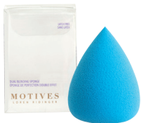
Dual Blending Sponge | 20132