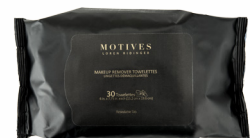
Makeup Remover Towelettes | 01MEMT