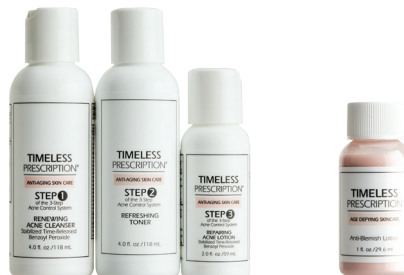
For Acne Timeless Prescription 3-Step Acne Control System | 11137 Timeless Prescription Anti-Blemish Lotion | 1269