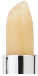
Vitamin E Lip Treatment | 41MVITE