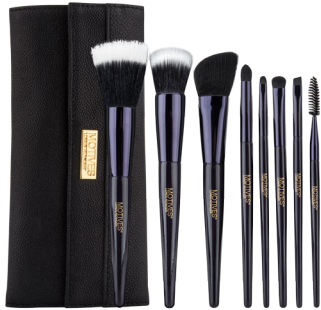
8-Piece Deluxe Brush Set | 46MBR or 15-Piece Pro Brush Set | 49MBR