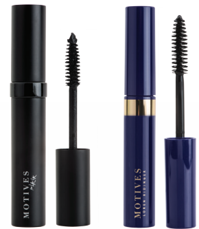
Preferred Mascara La La Mineral | 100MLM Lustrafy | 100MSM