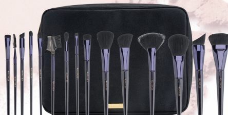
8-Piece Deluxe Brush Set | 46MBR or 15-Piece Pro Brush Set | 49MBR