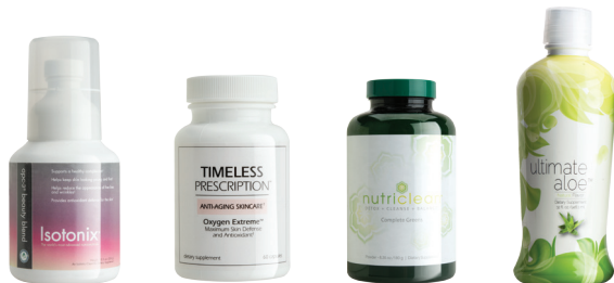
Beauty Inside-Out Isonix Beauty Blend, Timeless Prescription, Oxygen Extreme, NutriClean Complete Greens, Ultimate Aloe