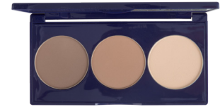
3-in-1 Contour, Bronze & Highlight Kit | 101MSD