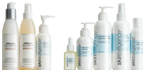
For Rosacea Timeless Prescription and Skintelligence Value Kit | 11146 Skintelligence 5-Piece Set | 1200