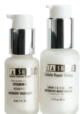
VitaShield Vitamin C & E Intensive Moisturizer Kit | 1251