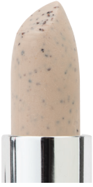
Lip Pumice | 40MLIP