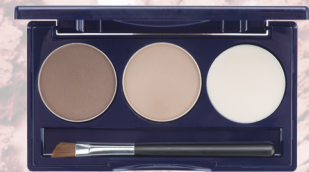
Essential Brow Kit | 100MBK