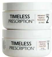
Timeless Prescription Advanced Hydroxy Face Peel and Neutralizer | 11136

Not required to attend class; education provided