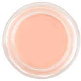
Eye Base | SB01