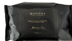
Motives Makeup Remover Towelettes | 01MEMT