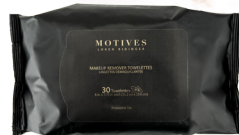
Makeup Remover Towelettes | 01MEMT