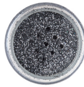
Glitter Pot (any color)