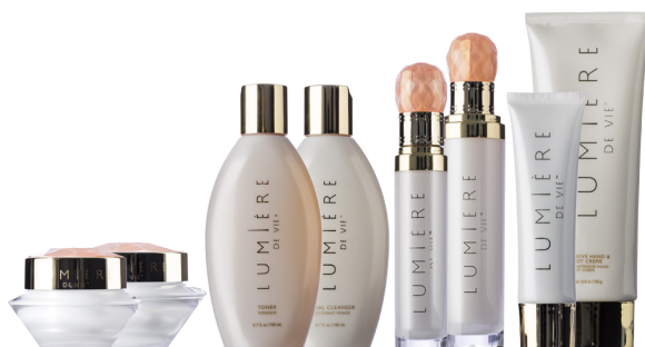
Lumière de Vie Full Regimen Kit | 12209