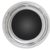
Gel Liner Little Black Dress | 002GEL2