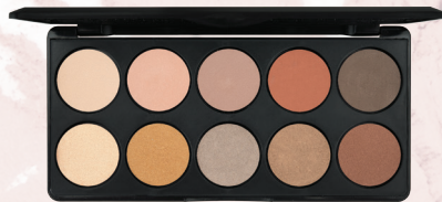
Shadow Palette of Choice (classic neutrals) Mavens Element | 1LMT Demure | 10PEM