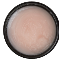
40FY Lip Treatment | 499MLT (anti-aging)