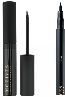
Preferred Liquid Liner (one or both) Liquid | 20MLE Luxe Precision | 23ELP